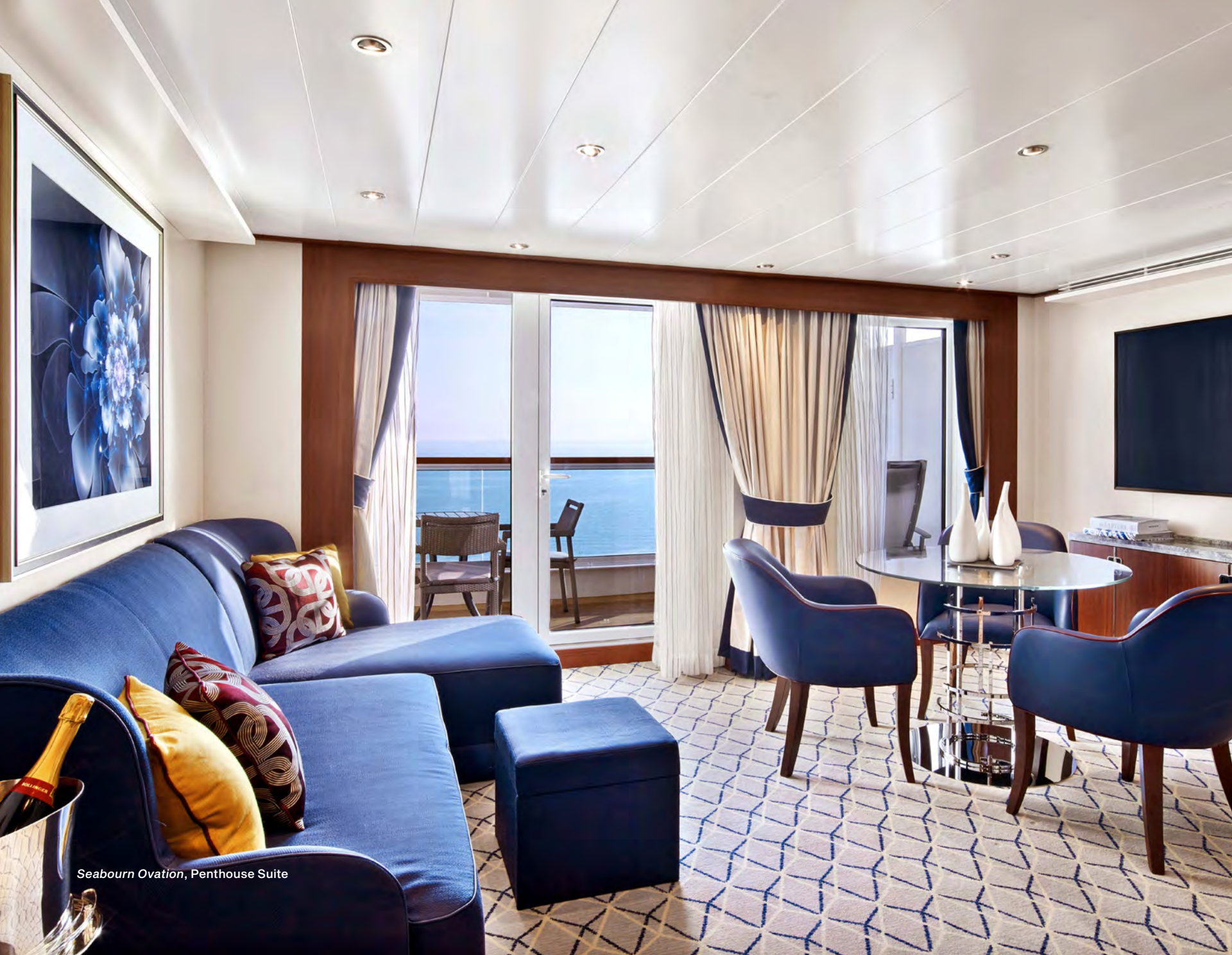
Seabourn Ovation, Penthouse Suite

†Not available on board Seabourn Venture