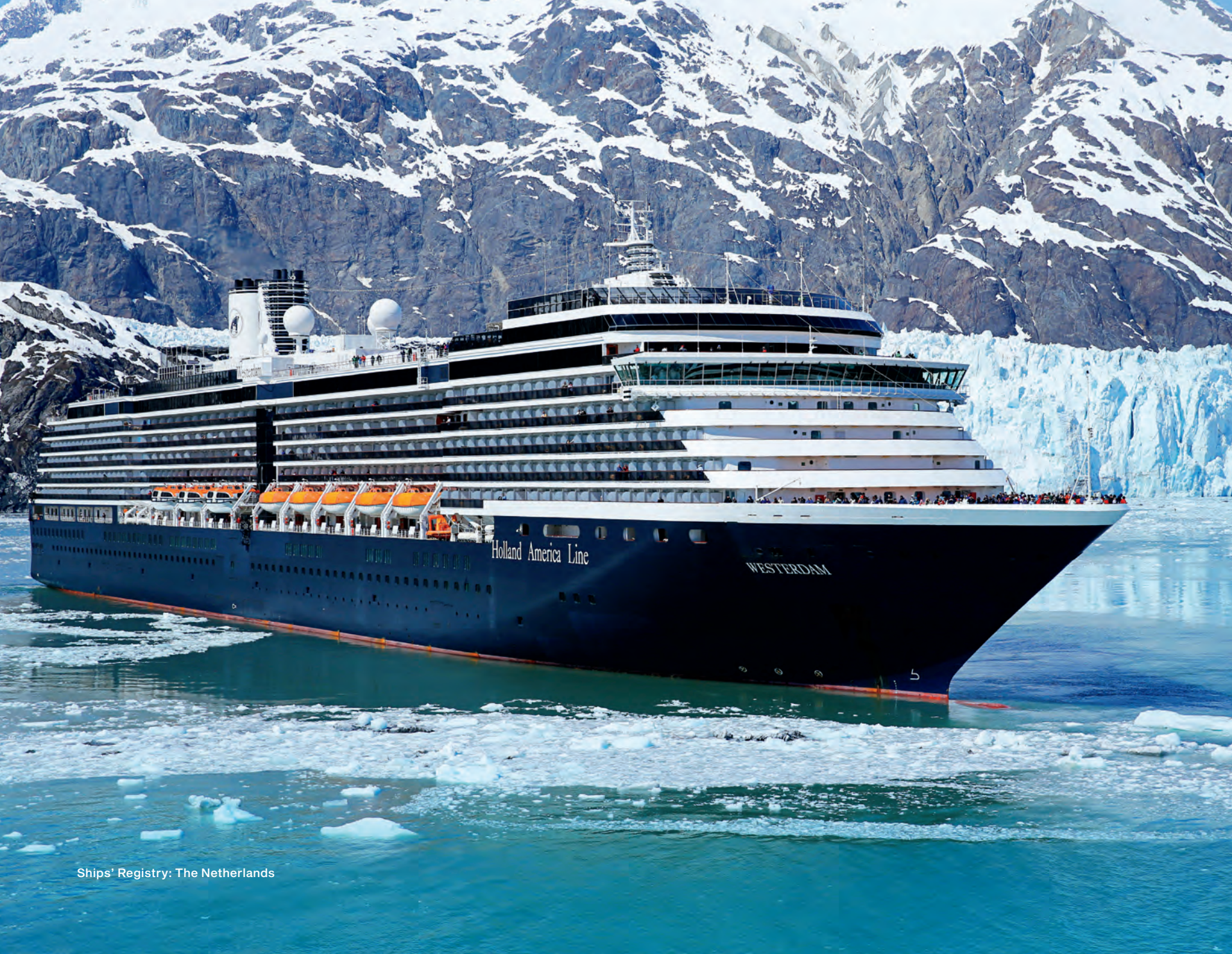
Ships' Registry: The Netherlands

To learn more, call 877-724-5425 or visit hollandamerica.com